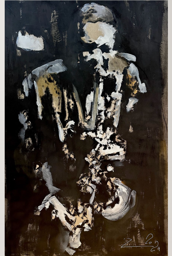
195 X 125 ★ CHF 8800.-