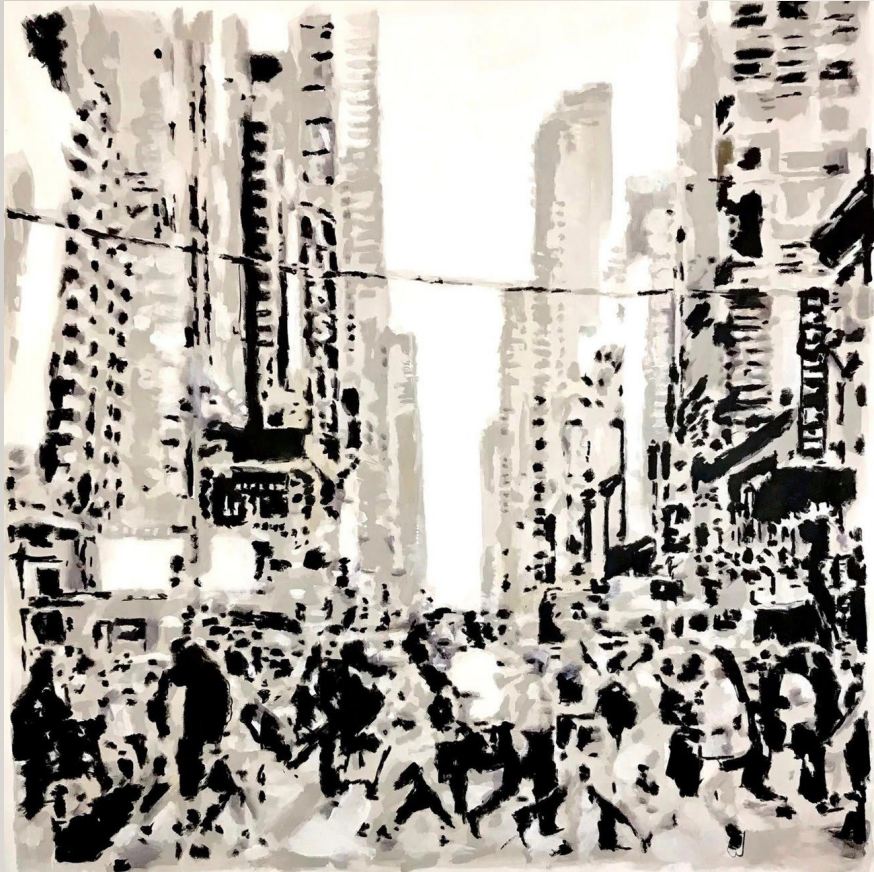
190 X 190 ★ CHF 9400.-