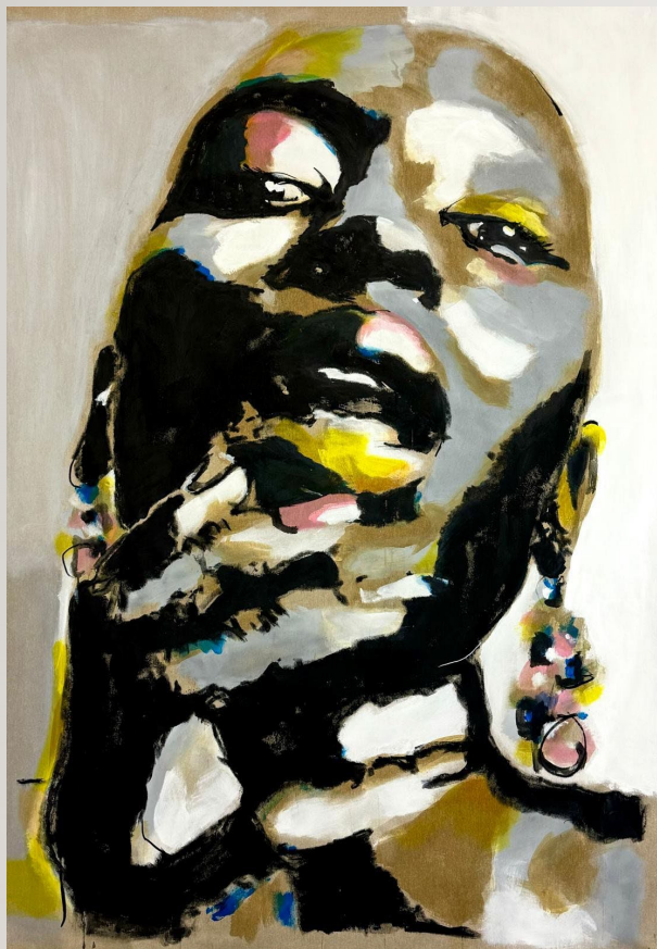
200 X 140 ★ CHF 8500.-