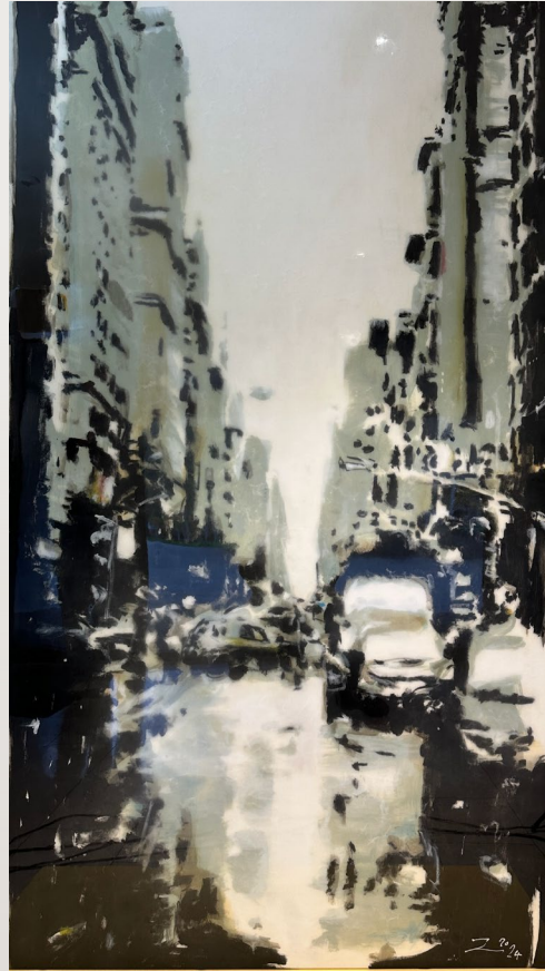
200 X 115 ★ CHF 8600.-