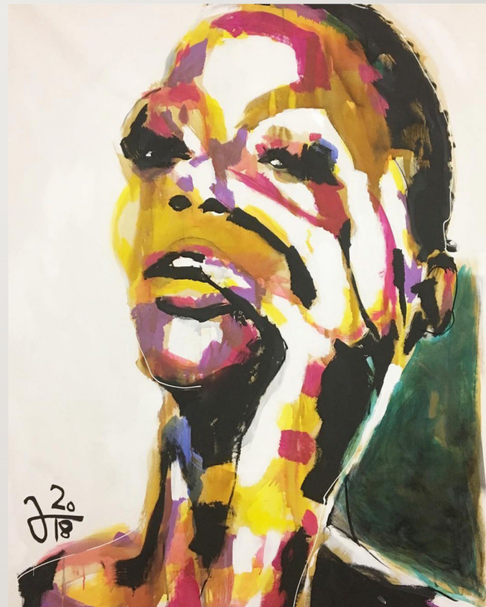
155 X 110 ★ CHF 6300.-