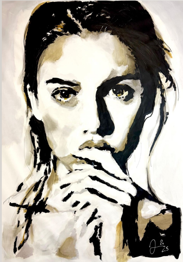
195 X 135 ★ CHF 8200.-