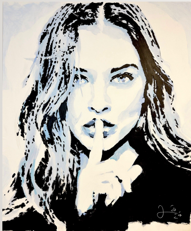
200 X 165 ★ CHF 8700.- SOLD