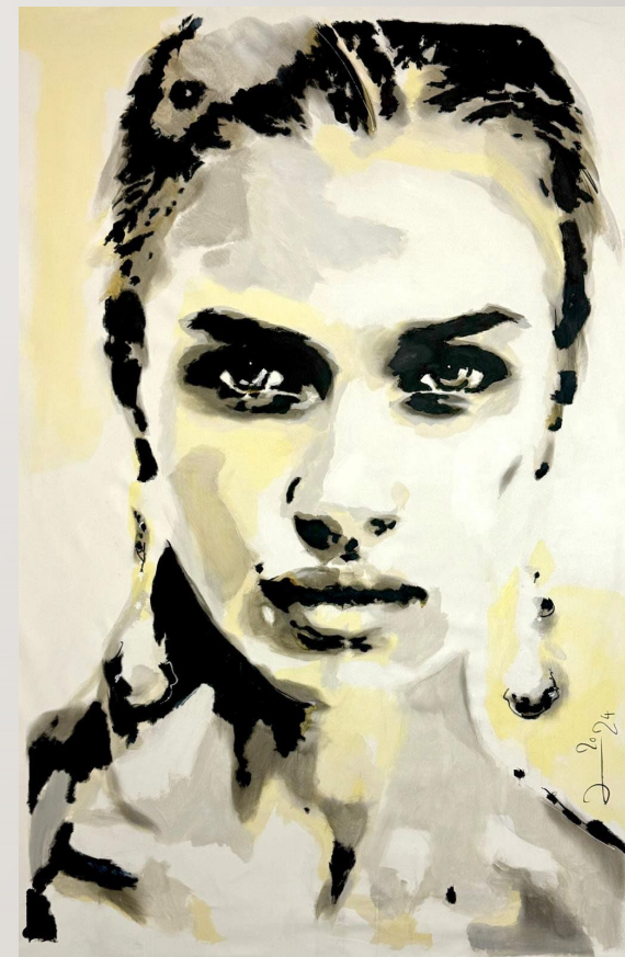
200 X 130 ★ CHF 8500.- SOLD