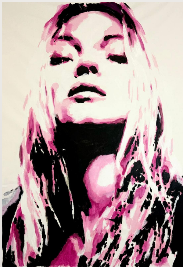
195 X 135 ★ CHF 8200.-