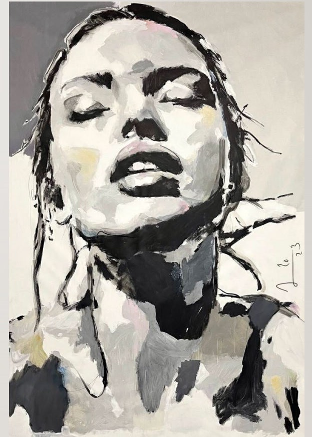
200 X 155 ★ CHF 8600.-